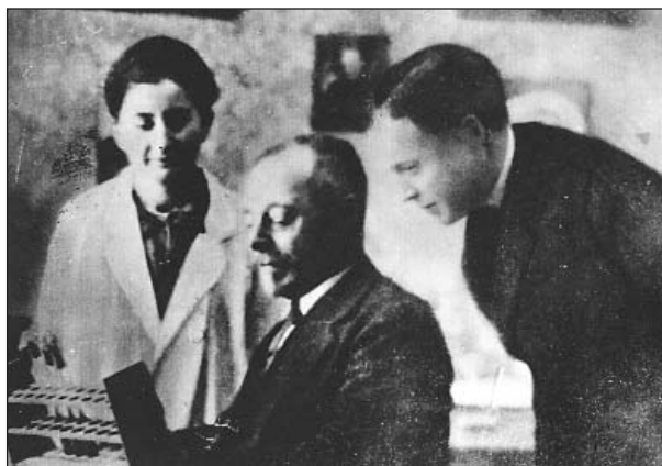
Heady days. Félix d'Herelle (seated) and Giorgi Eliava (right) in Tbilisi shortly before Eliava was shot.

The Soviet military was perhaps the biggest consumer of phage preparations, many of which were produced in Russia—and still are—according to Georgian tech-