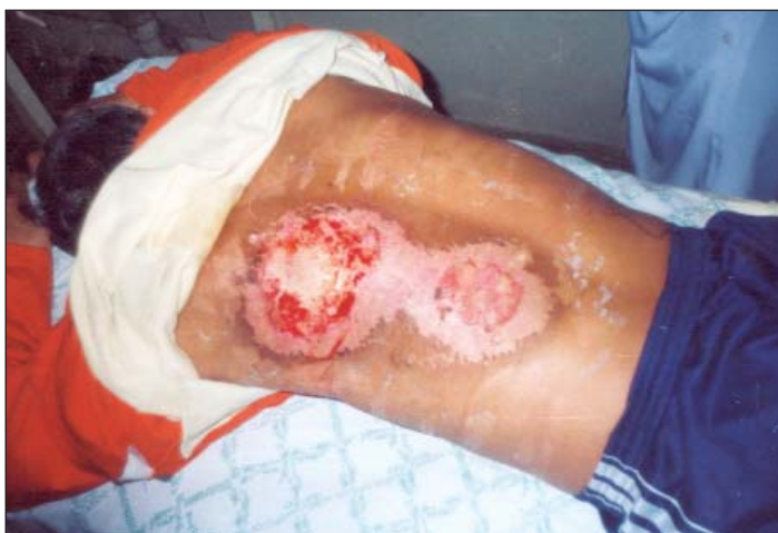
Irradiated. Georgian doctors covered this man's radiation burns with patches that released bacteriophages into the wound as they degraded.